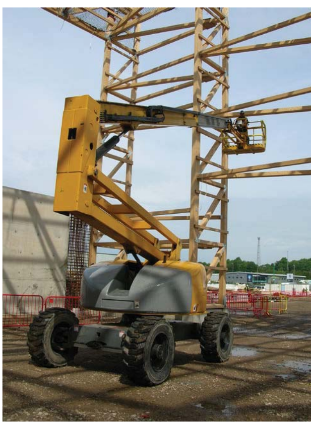
Figure 1 Operating a MEWP near overhead structures

focuses on minimising the overturning risks associated with mobile work equipment such as MEWPs. This is particularly relevant when considering the ground, environmental and operating conditions that the MEWP may experience.